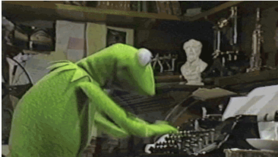
Figure 2: Kermit