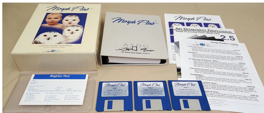
Figure 4: mp